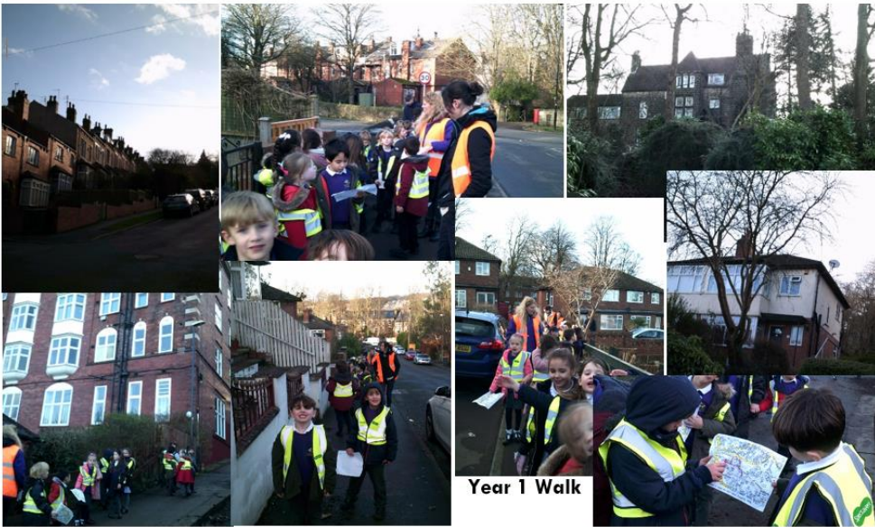
Year 1 Walk